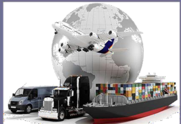
LOGISTICS & PROCUREMENT

Our specialty procurement department sources products, equipment and services both locally and internationally either as direct purchaser and reseller or as agent for clients. The activities are based on creative and cost effective purchasing and cost control. Therefore procedures and structures are in place, from initial tender/bid request until delivery and incoming inspection of the goods. Our logistics team executes material and equipment delivery strategies for proposals and projects by offering purchase/hire/lease and service for automobiles, trucks and heavy equipment. As part of our service we also assist with local sales and importation of new and pre-owned vehicles, Trucks and heavy equipment.