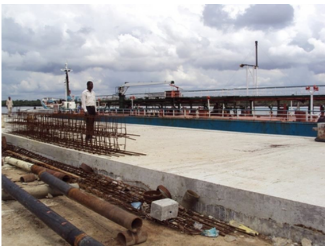
Complete reinforced concrete apron behind shore wall

Our clients recognize our first class professional mode of operation & safety measures applied in ensuring that we don't end up causing erosion instead of protecting the shorelines.