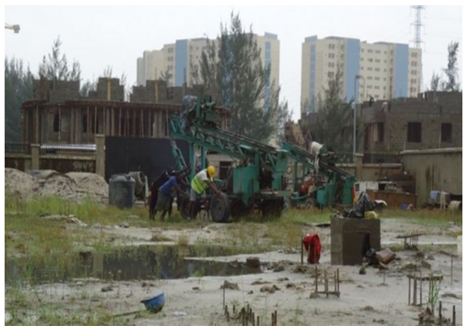
Construction of Pile Foundation (Bore Pile) at Banana Island, Lagos