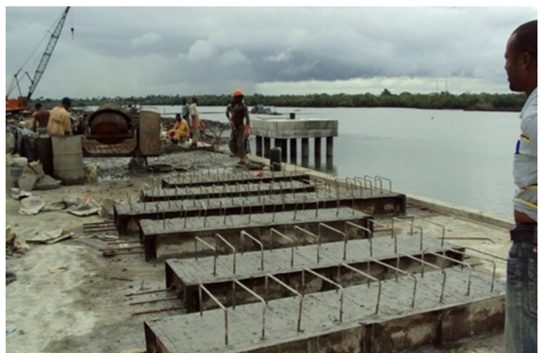
Precast beam for reinforced concrete apron behind shore wall