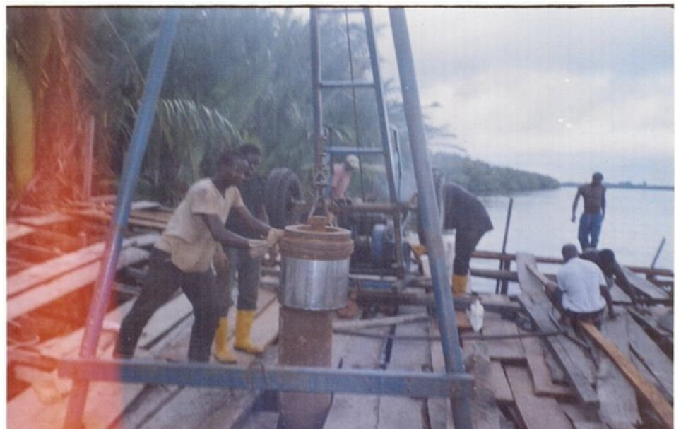
Construction of breasting jetty for Basumoh tank farm project