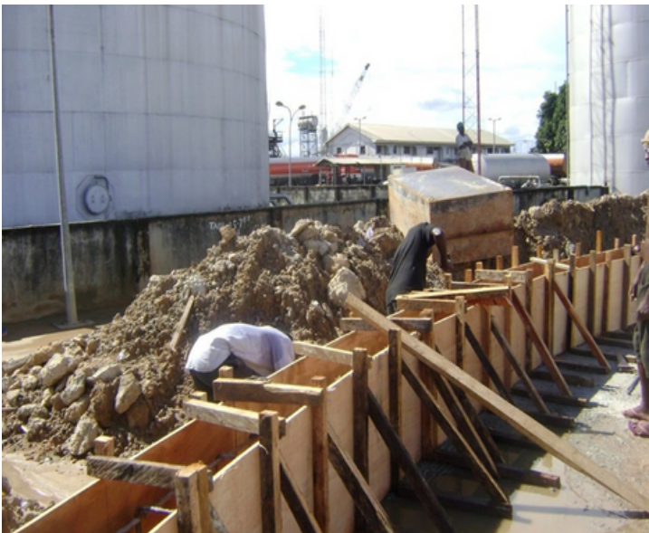
Formwork for ring beam construction at Port Harcourt Conoil Depot