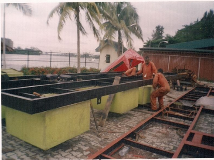
Construction of floating jetty for American Embassy

We assist our clients with their underground engineering work. Specific services include: