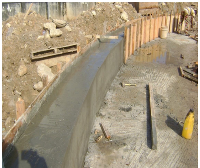
Freshly Cast Ring Beam