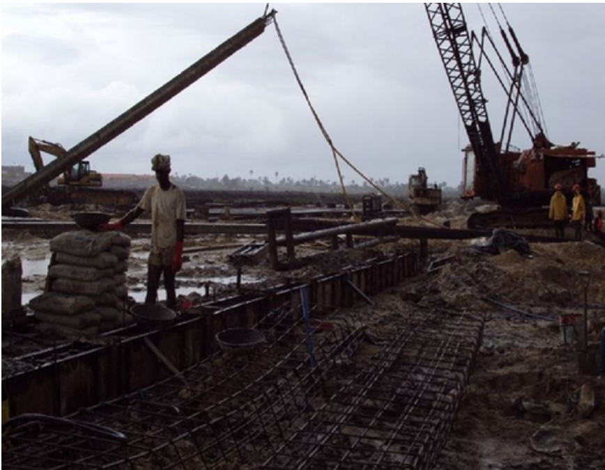
Crane lifting 14m of sheet pile to be installed